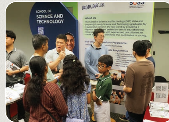
SUSS OPEN HOUSE 2024