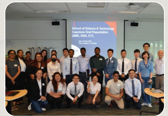
SST CAPSTONE PRESENTATION 2023