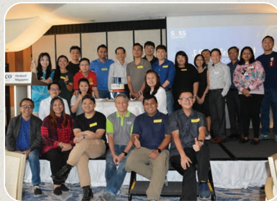
CONVOCAION LUNCH 2023