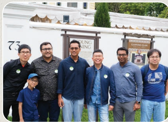
SST ALUMNI NIGHT 2023