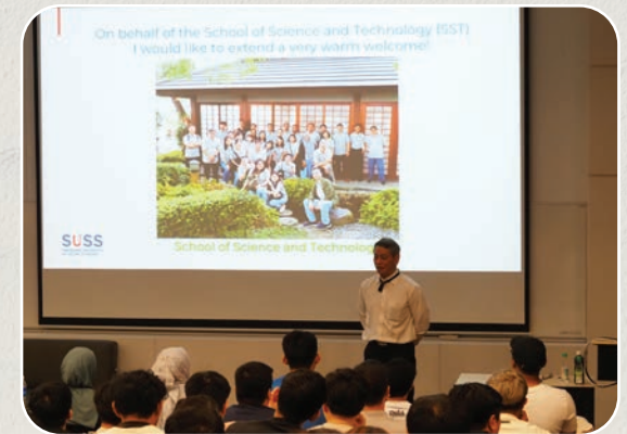
STUDENT ORIENTATION 2024