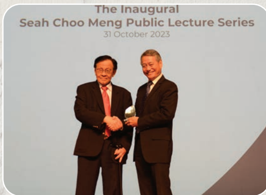
INAUGURAL SEAH CHOO MENG PUBLIC LECTURE SERIES 2023