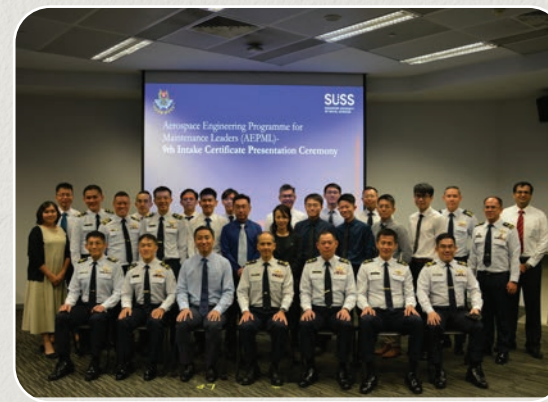
CERTIFICATE PRESENTATION CEREMONY FOR AEROSPACE ENGINEERING PROGRAMME